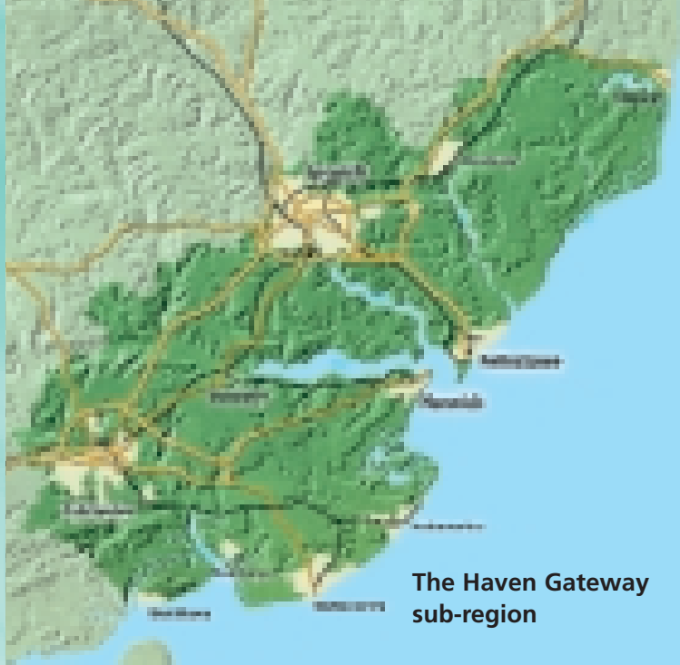
The Haven Gateway sub-region